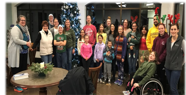
Giving Tree Delivery to Bella Vista