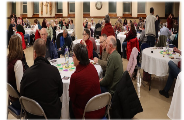
Wine & Cheese Social