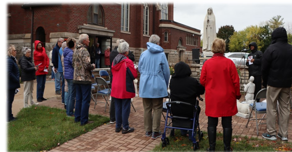
Our Lady of Fatima Rosary Rally