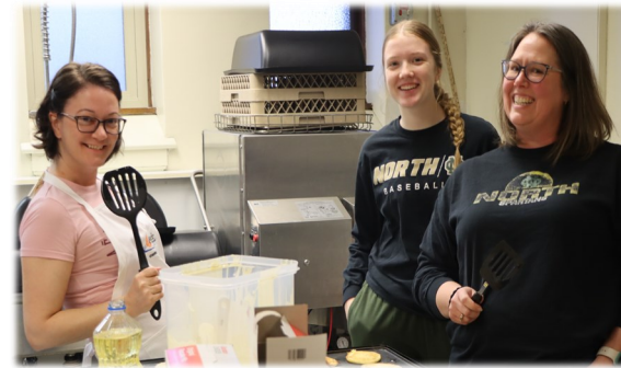
Shrove Tuesday—Pancake Supper