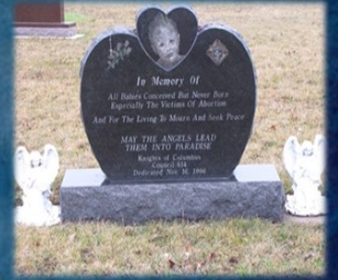
Monument to the Unborn: Calvary Cemetery, Oshkosh

Please become a sponsor to light the monument!